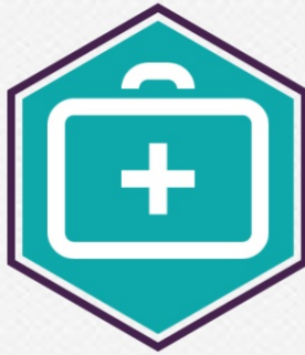
Shortage of Service Providers in Area