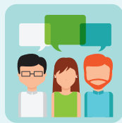
Understanding and use of receptive and expressive language